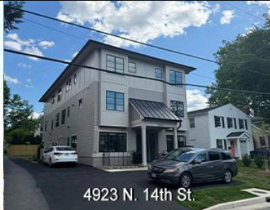
4923 N. 14th St.