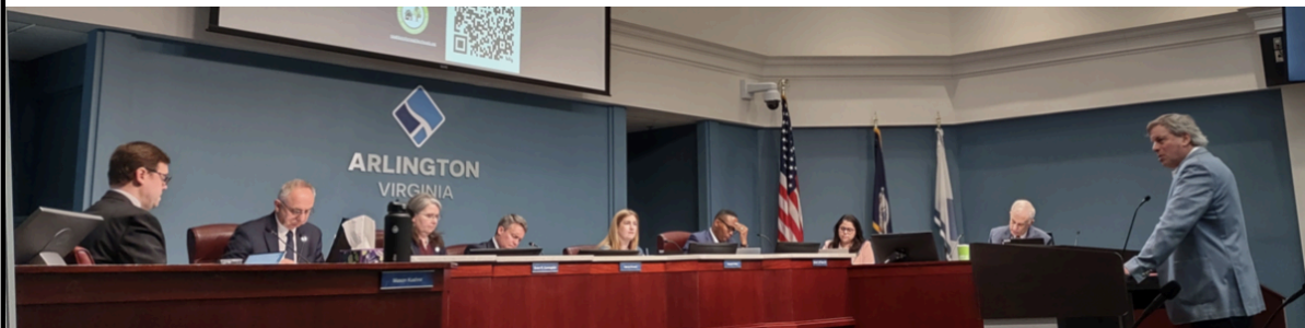
Neighbors for Neighborhoods before the Arlington County Board