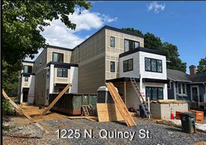
1225 N. Quincy St.